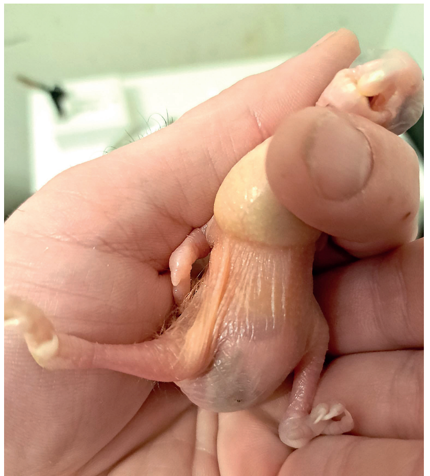
▲ A seven days old Galah with the splayed leg