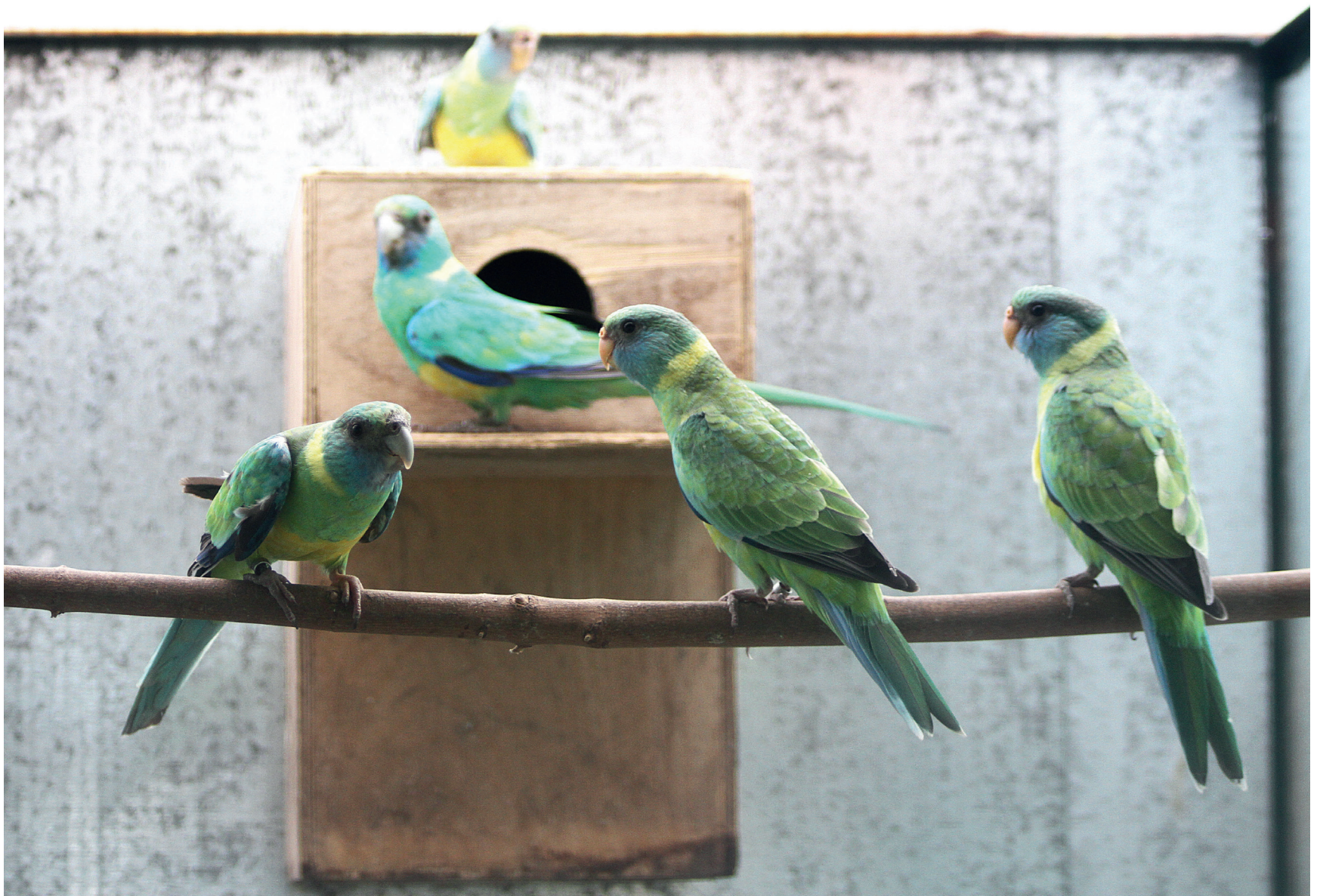
Cloncurry Parakeets ( Barnardius zonarius macgillivrayi )

T o successfully combat the endoparasites Ascaridia and Capillaria , undoubtedly the most common in Australian Parakeets, I will explain interesting background knowledge to better understand their life cycle and the possible therapeutic measures derived from this.